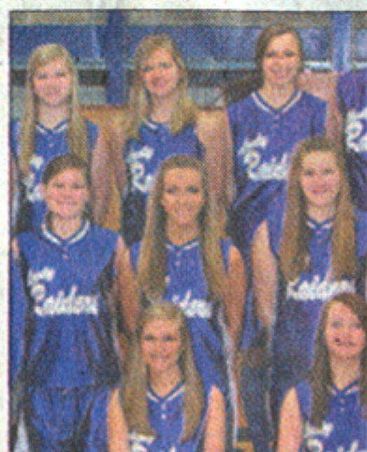
Spring sports schedules. See page C2