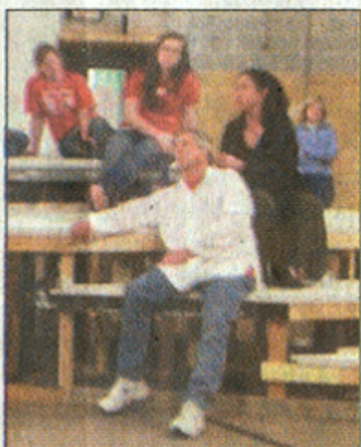
Calhoun Entertainment Company preparing for show. See page A2